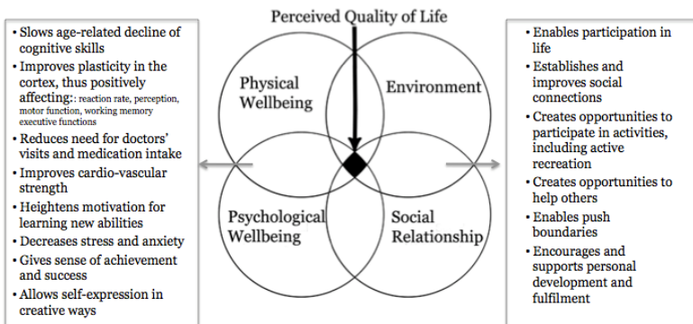
Figure 1. Effects on learning an instrument as an older adult on perceived quality of life.

style Profile (HPPL-II; Walker et al. 1987; from the six subscales only stress management was considered). Four-point Likert scales gathered data for the variables (4) flexibility and (5) medicine intake. Qualitative data were obtained through observation of the keyboard group ( n=6 ) as well as an individual case study: a sixty-six year old participant with osteoarthritis.