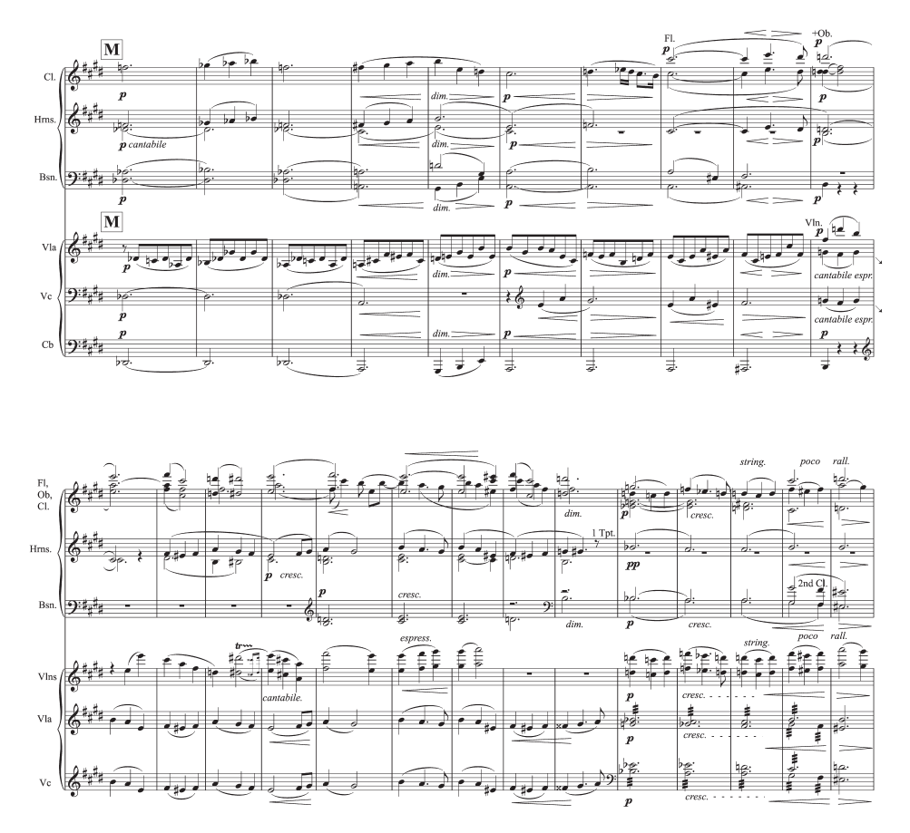
EXAMPLE 8 bb. 301-324

tremolo string accompaniment (bars 320–323) is further hint at romantic textures used frequently by other composers and is particularly effective because it is only heard twice in the overture.<sup>92</sup>