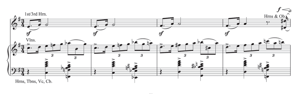
Example 12 bb. 580-587