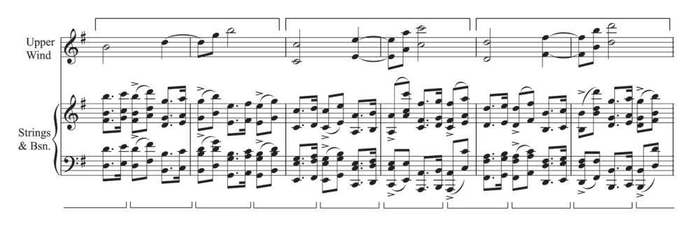
EXAMPLE 3 bb. 58-63

Prolonged harmony and a rising chromatic scale continue this intensification of the scene, especially when combined with hemiolas and syncopation.