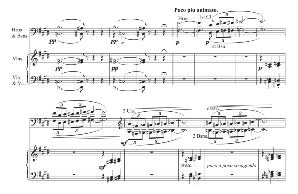
EXAMPLE 9 bb. 381-394

A much more explicit erotic reading of the Rose Festival than I have given here is conceivable. Given his knowledge and appreciation of Wagner's music, it does not seem too far-fetched to suggest that there might be parallels with the Venusberg music from Tannhäuser .<sup>93</sup> Phrase structure, melodic shape, articulation, and climax-building could all be analysed to explain how Goldmark achieves sensuousness in music. Similar to a matching of operatic text with specific musical ideas, features might be pinpointed that could depict key events, images or lines from Kleist's play. In all probability some contemporary listeners did indeed create their own fantasies around what they heard, as they did even with Brahms's absolute music.<sup>94</sup> However, as far as is known, Goldmark did not speak of these aspects of Penthesilea , if indeed they are to be understood in this way. He certainly never supplied an explicit programme as did Wagner for concert adaptations of his works.<sup>95</sup> Considering the company Goldmark generally kept around this time, which roughly equated to the circle of friends around Brahms, possibly, as Clara Schumann felt about Wagner's music,<sup>96</sup> it was beyond the limits of decency for him.