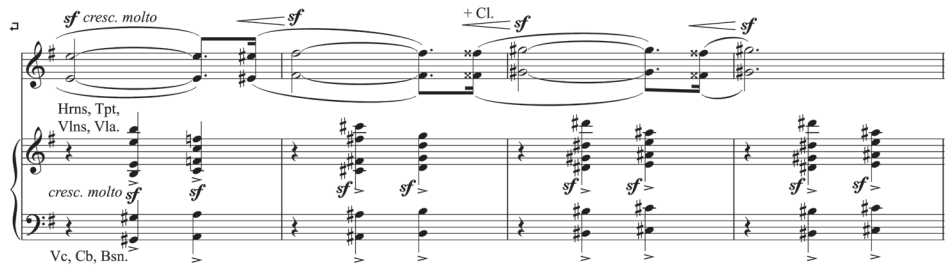
Example 13 bb. 623-633