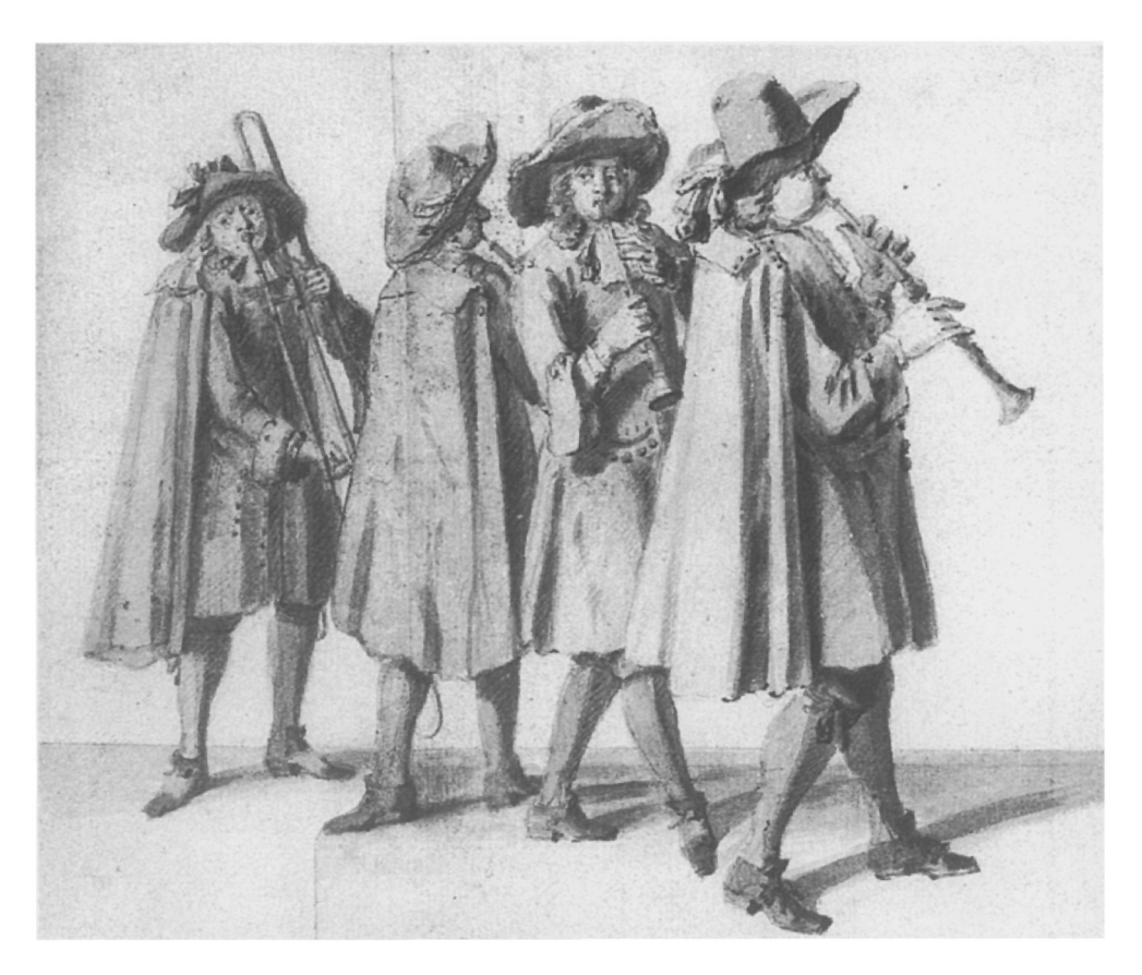
Figure 13 Seventeenth-century town waits, wash drawing attributed to Marcellus Laroon ( c .1649–1702).

and other declamatory pieces — or seasonal — perhaps marking annual civic progresses or anniversaries. Most major towns in the German and Italian states had such bands, and in England they existed in those places that had the status of being a city (by virtue of having a cathedral). Civic bands were essentially secular, but there is no doubt their trombonists, along with other players, were hired for religious services too.