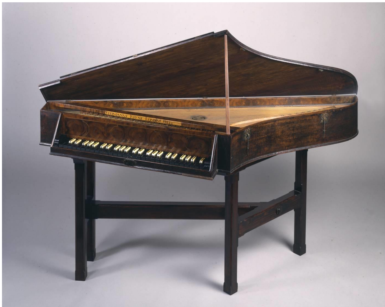
Spinet by Stephen Keene RCM 179